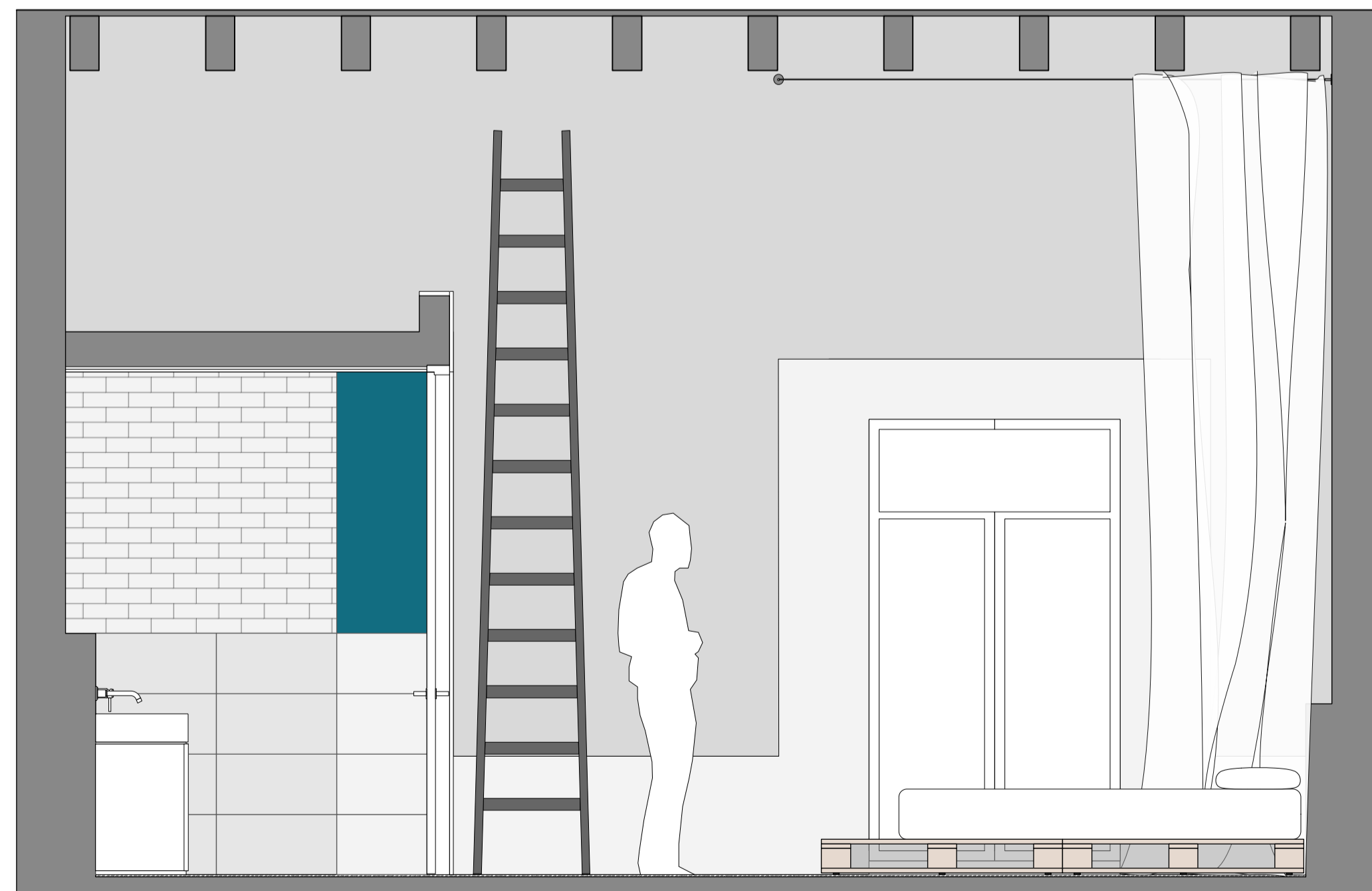
02 02 CROSS SECTION SCALE 1:50@A3