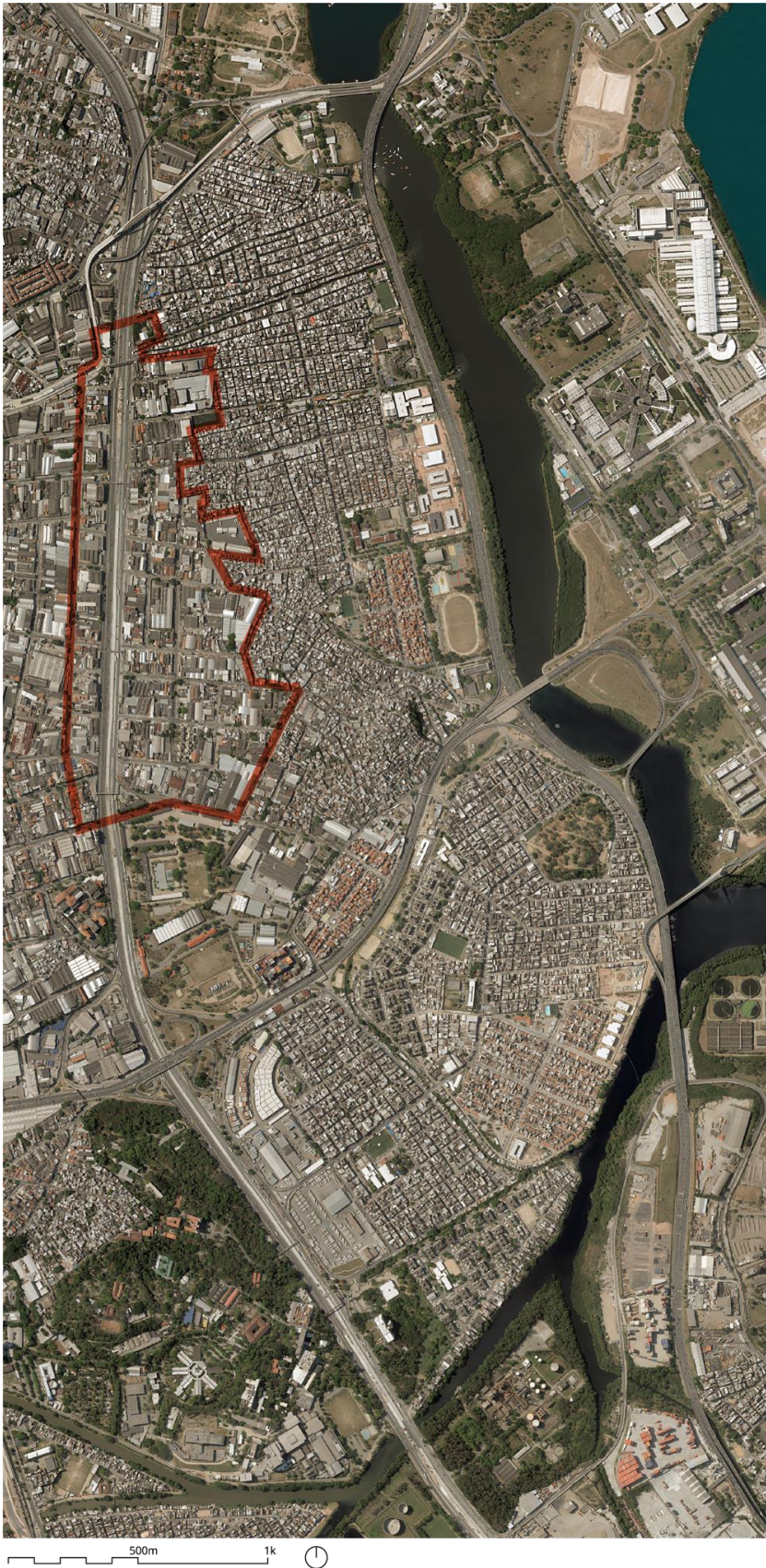
Figure 1: Outline of the project area.