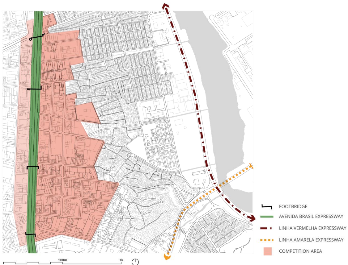
Figure 2: Competition site

These are the aspects that future architects and urbanists must consider so they may propose spatial concepts that add innovation to this set of social and cultural diversities. Emphasis must be given to the fact that there are no alternatives to deal with favelas without considering the spatial relationship with its surroundings and the formally built city.